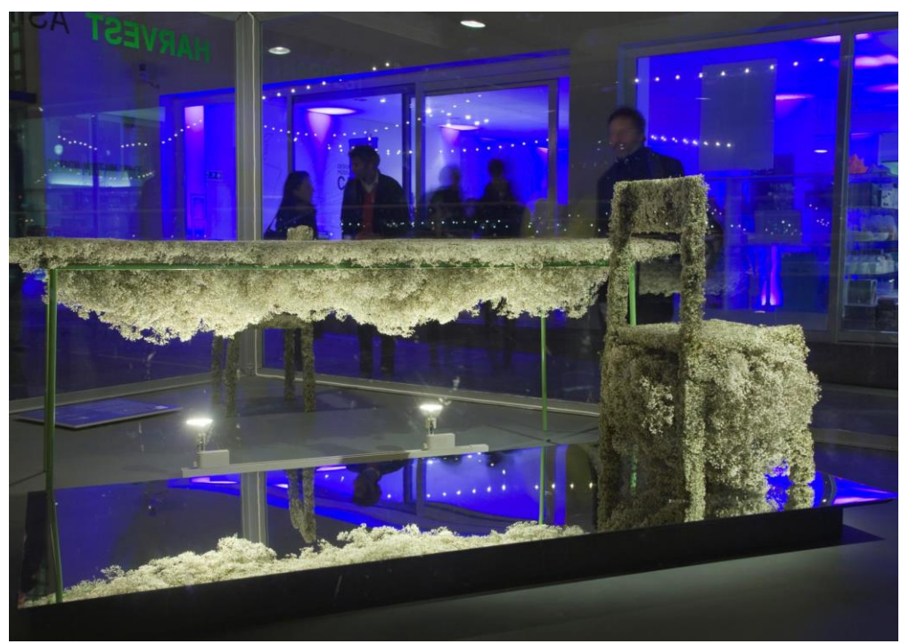
2008 – Asif Kahn