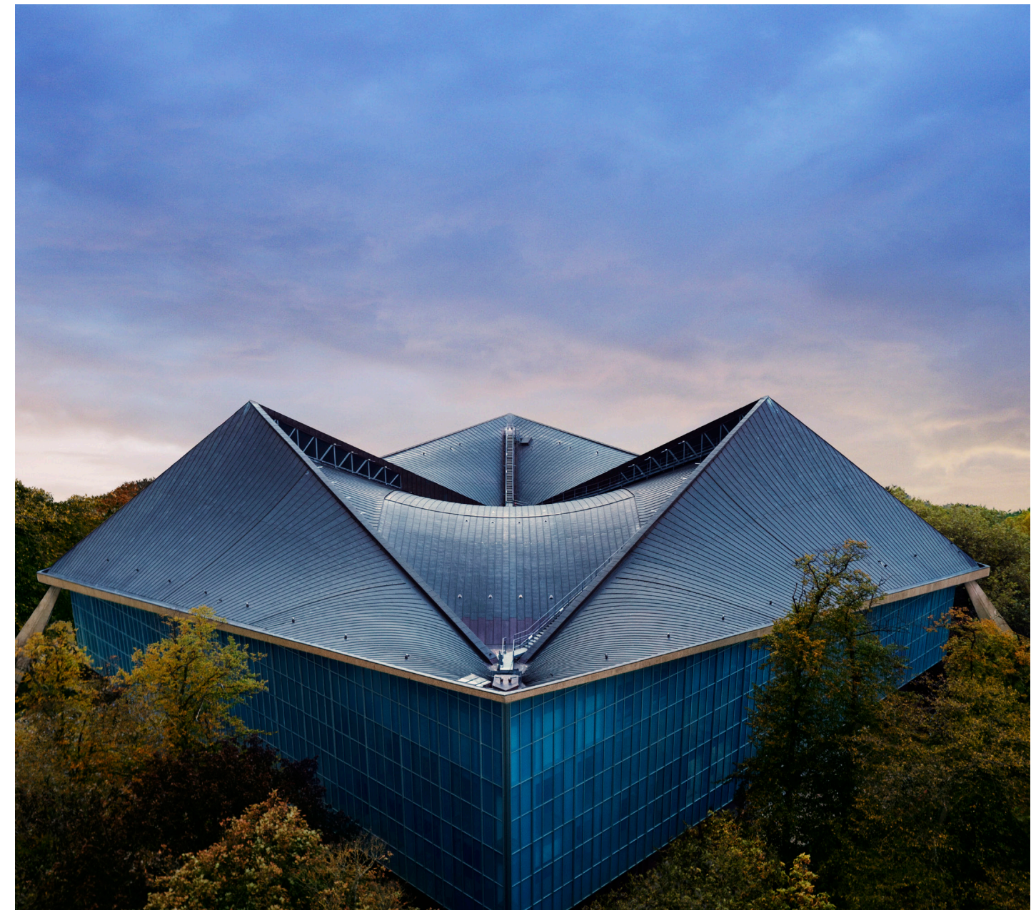
The Design Museum, London