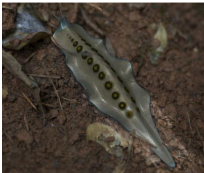
Images: 'Design Taxonomy' and 'Designing for the Sixth Extinction' (Designs of the Year 2015 nominated project)