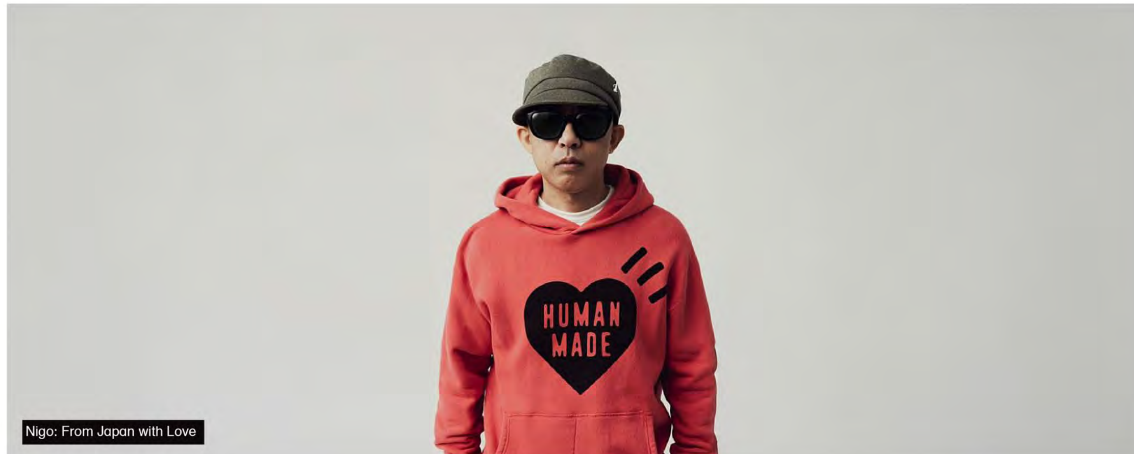
Nigo: From Japan with Love