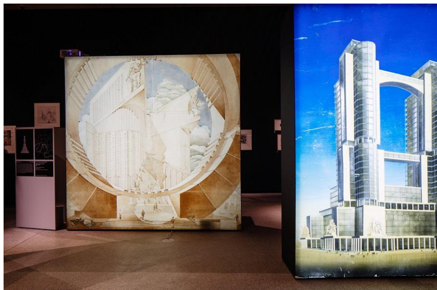
Imagine Moscow