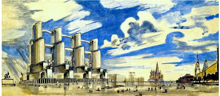
Vesnina brothers' Narkomtiazhprom proposal for Moscow, 1934

Leonidov's Lenin Institute (1927) , a monumental scientific research centre and planetarium that was planned for one of the city's highest hills, symbolically linking Moscow and the cosmos.