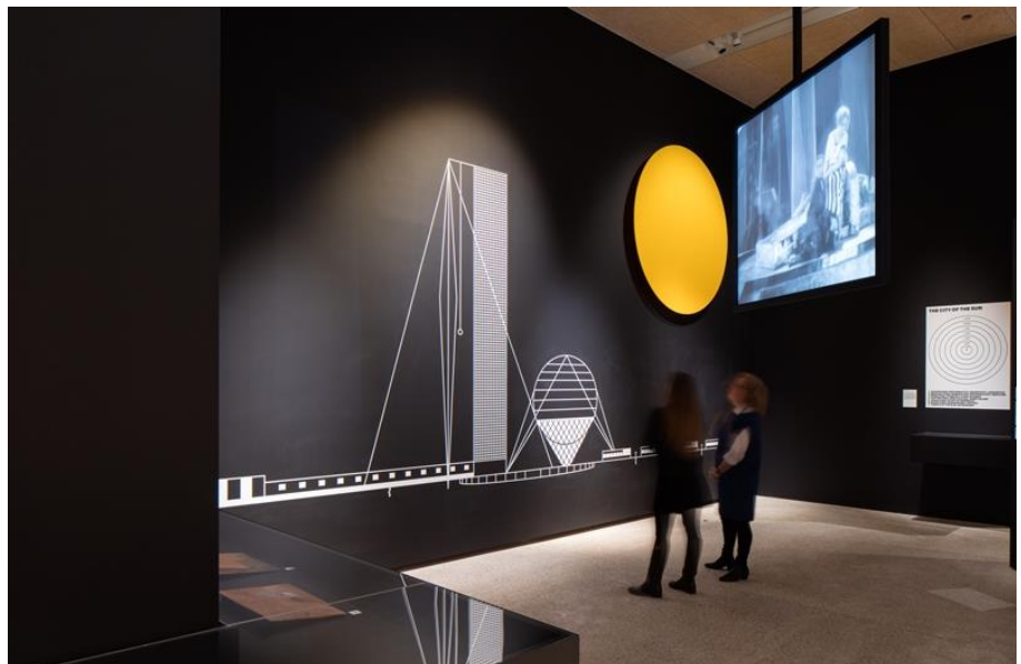
Imagine Moscow

The exhibition provides a sensory and immersive experience for visitors.