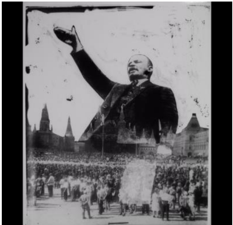
Alexander Rodchenko stencils, aviation, ca. 1930, Ne Boltai Collection