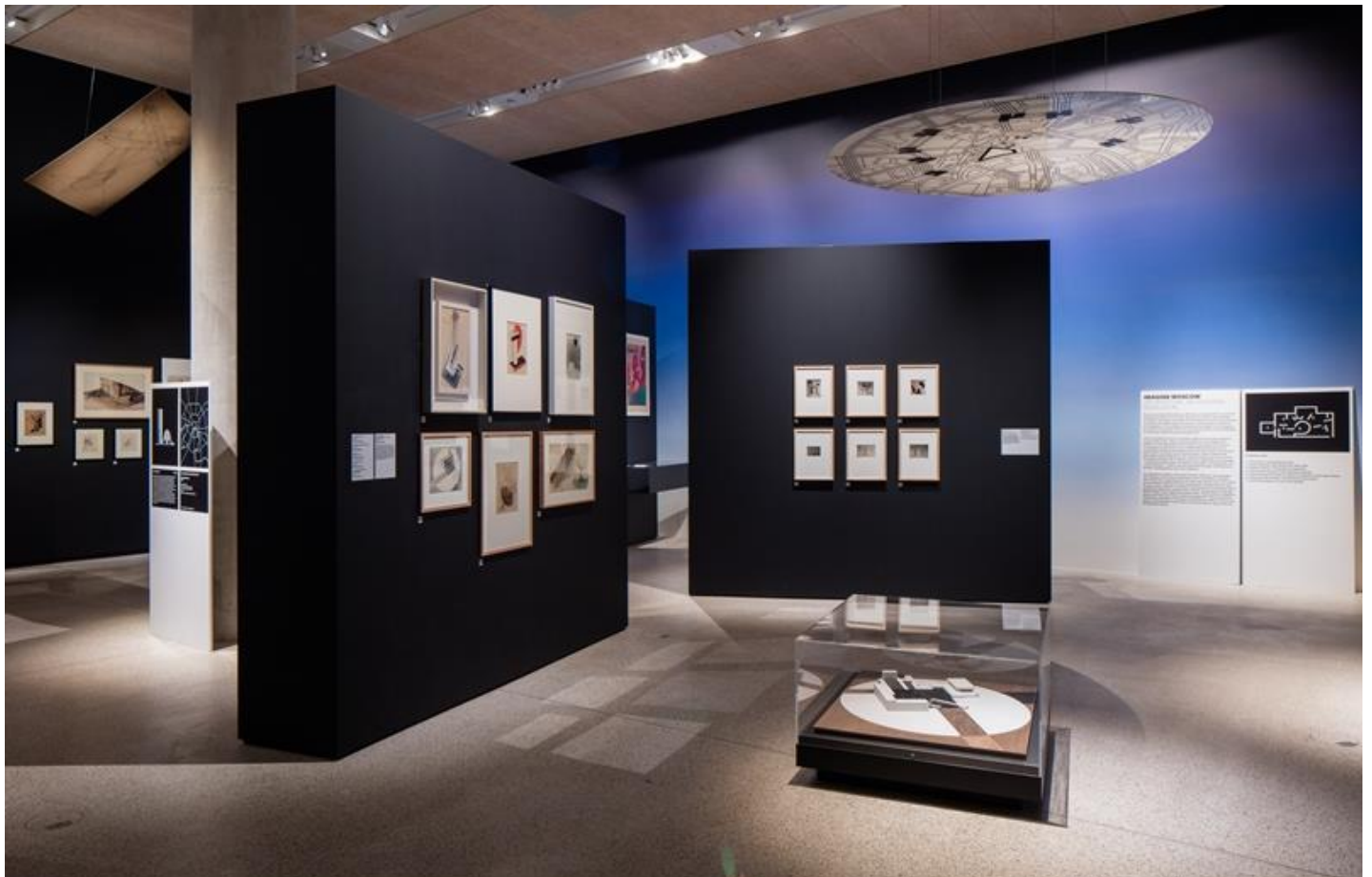
Imagine Moscow, photography by Luke Hayes