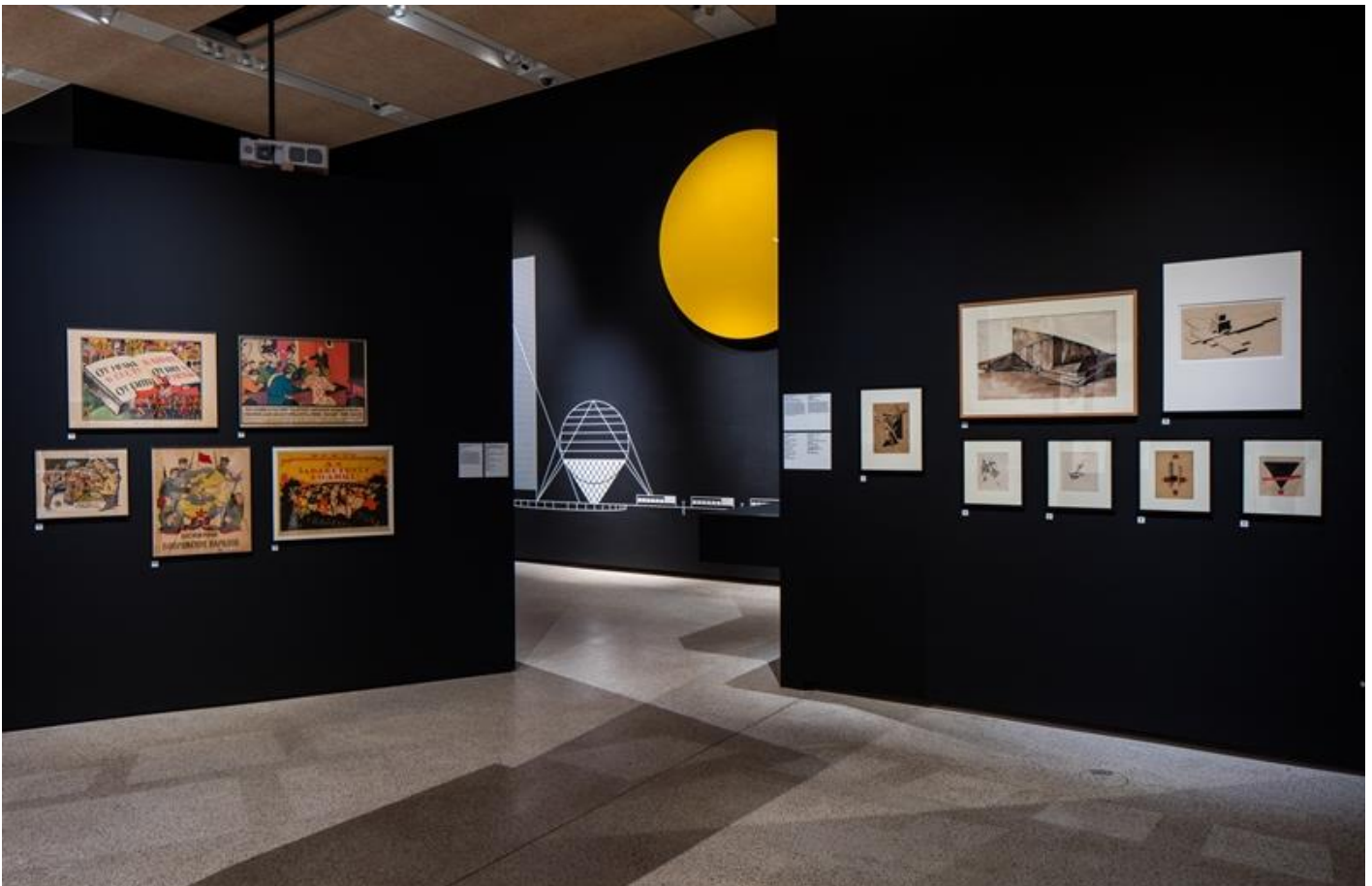
Imagine Moscow