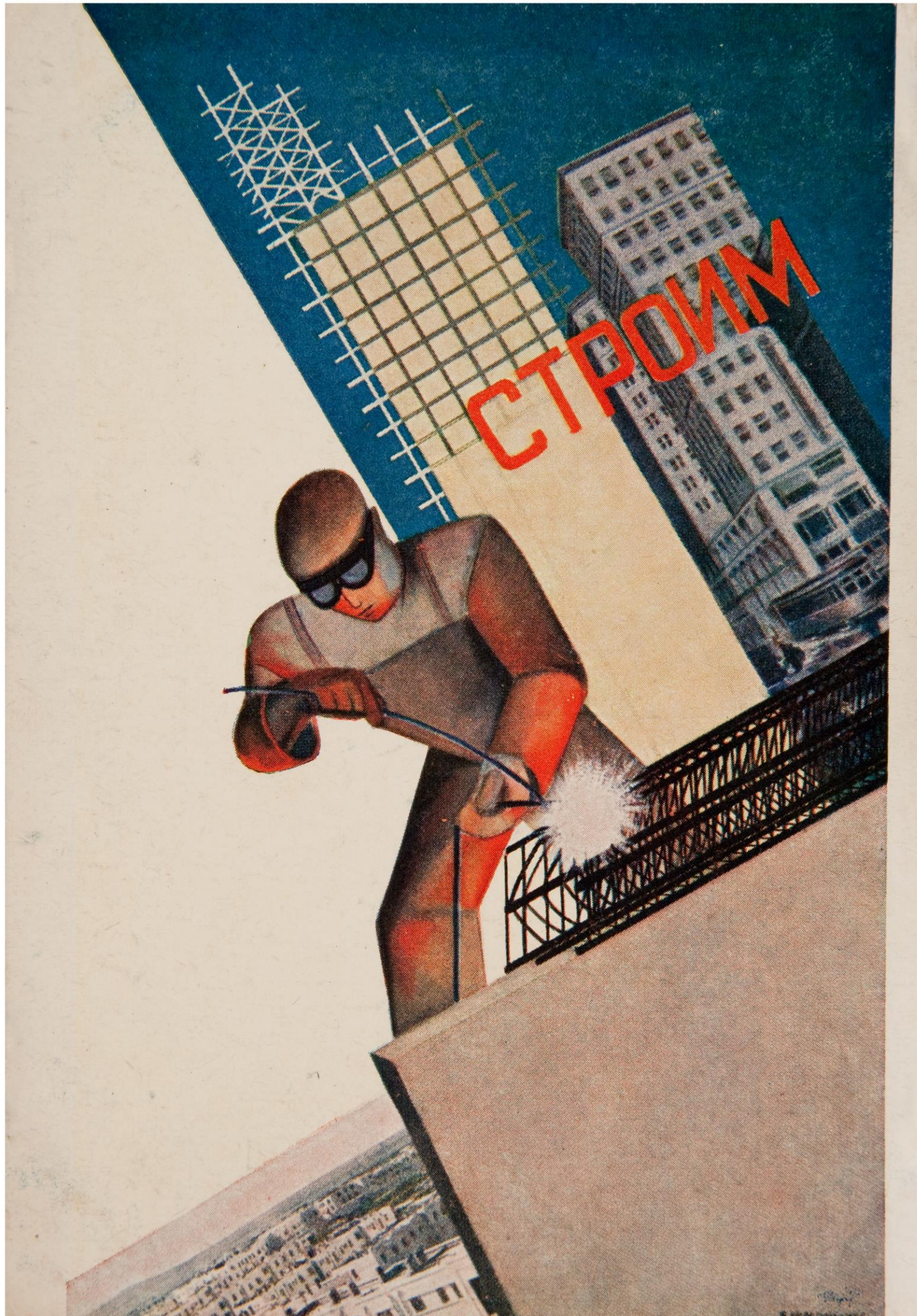
Valentina Kulagina, We Build, 1930's, Ne boltai! Collection