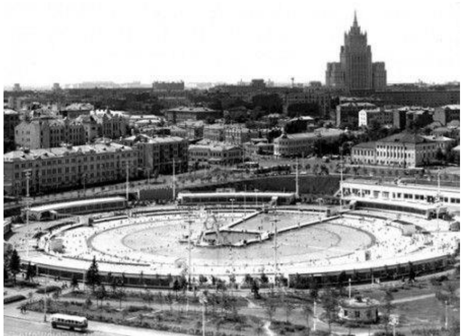
Moscow Pool on the foundations of the Palace of Soviets in Moscow, 1960

The Design Museum has recently opened in its spectacular new home on High Street Kensington and has grown its portfolio of touring exhibitions, available for hire from Spring 2017 onwards.