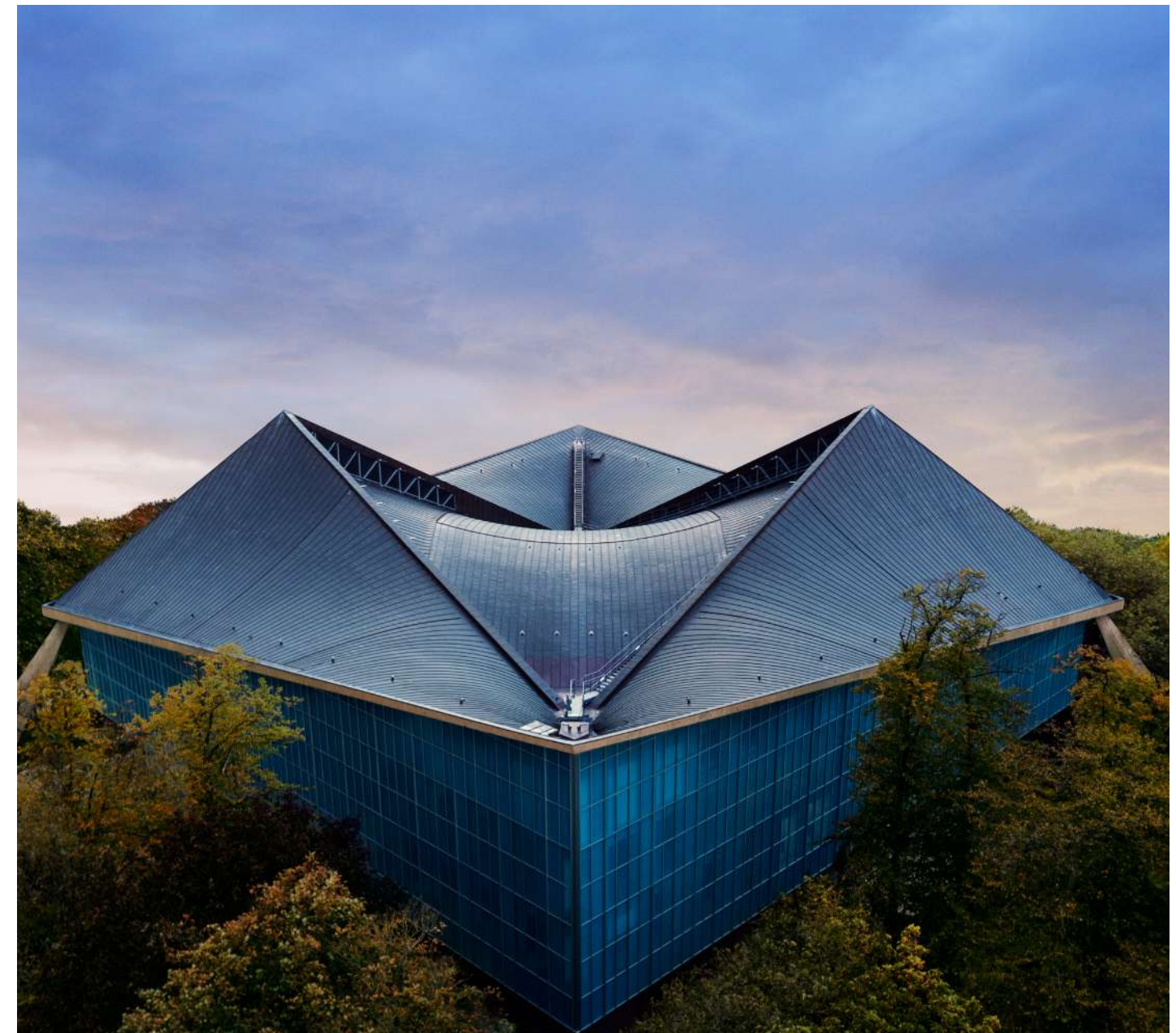
The Design Museum