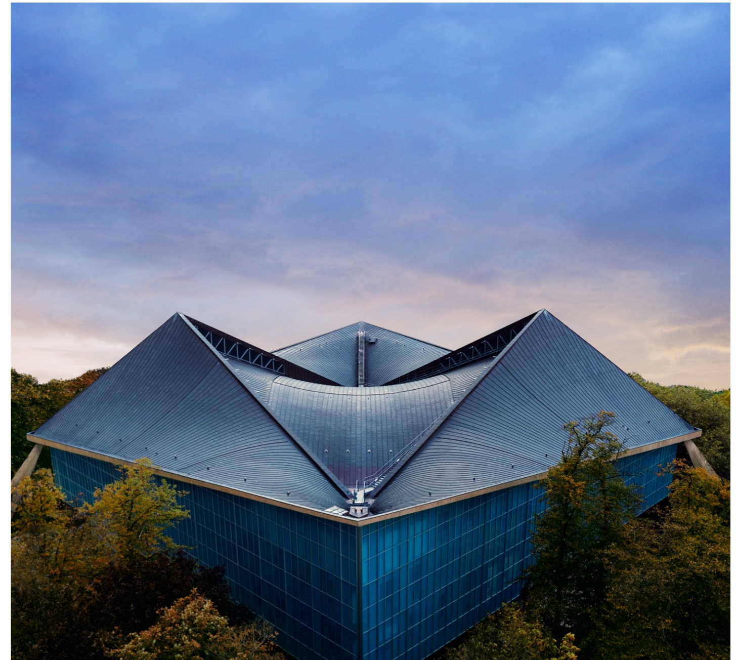
the Design Museum, London