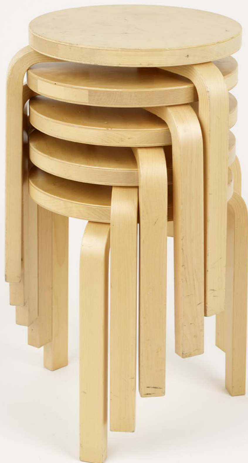
Stool 60, Alvar Aalto