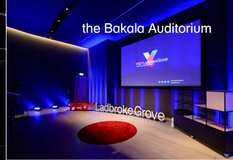
the Bakala Auditorium