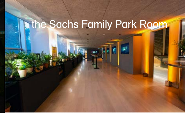
the Sachs Family Park Room