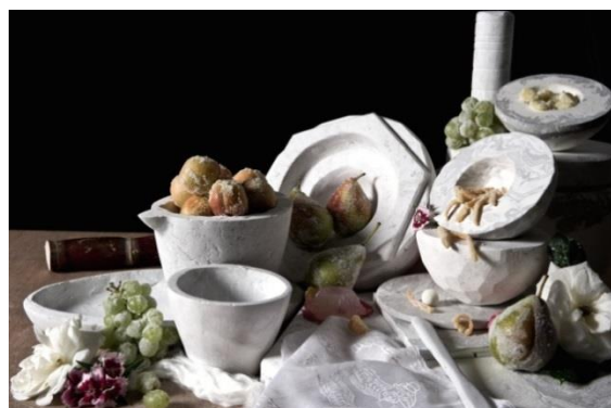
Project: Saccharum