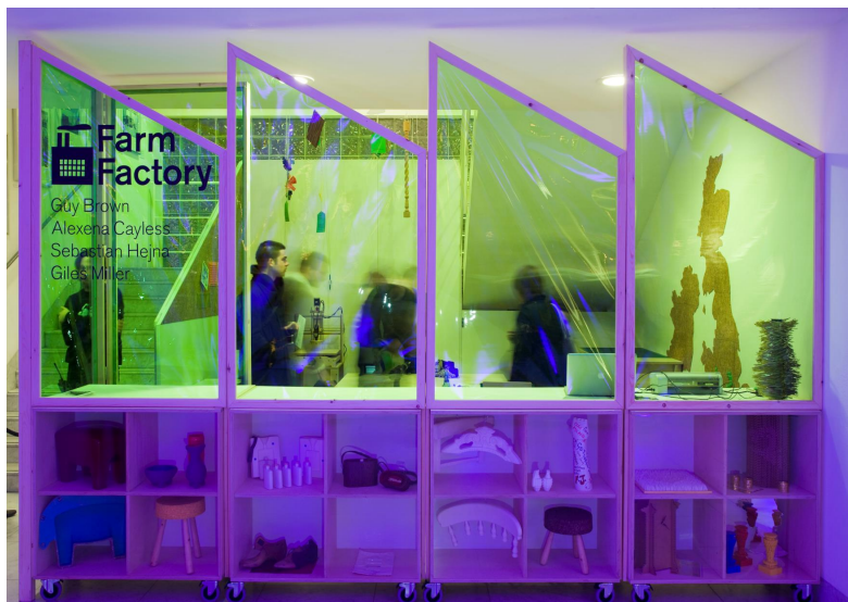
Farm Factory, Farm, 2010