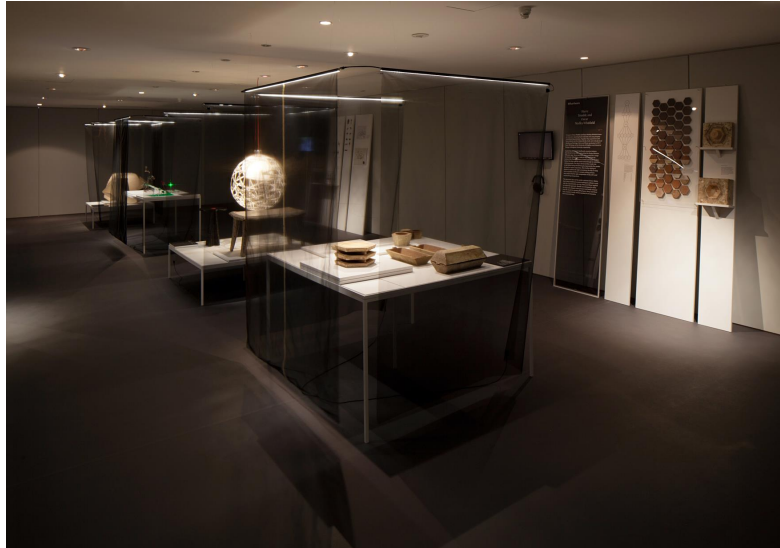
2012 Designers in Residence exhibition – Thrift