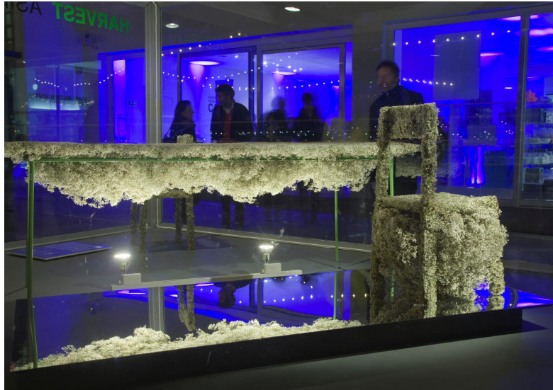
Harvest, Asif Khan, 2009