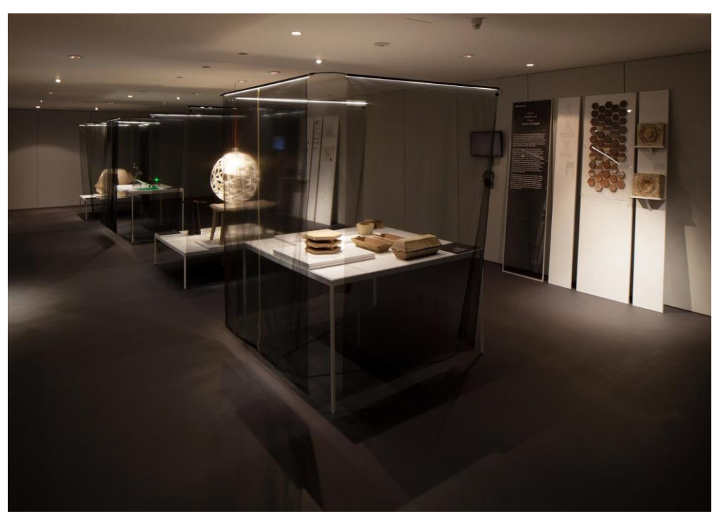
2012 Designers In Residence exhibition – Thrift