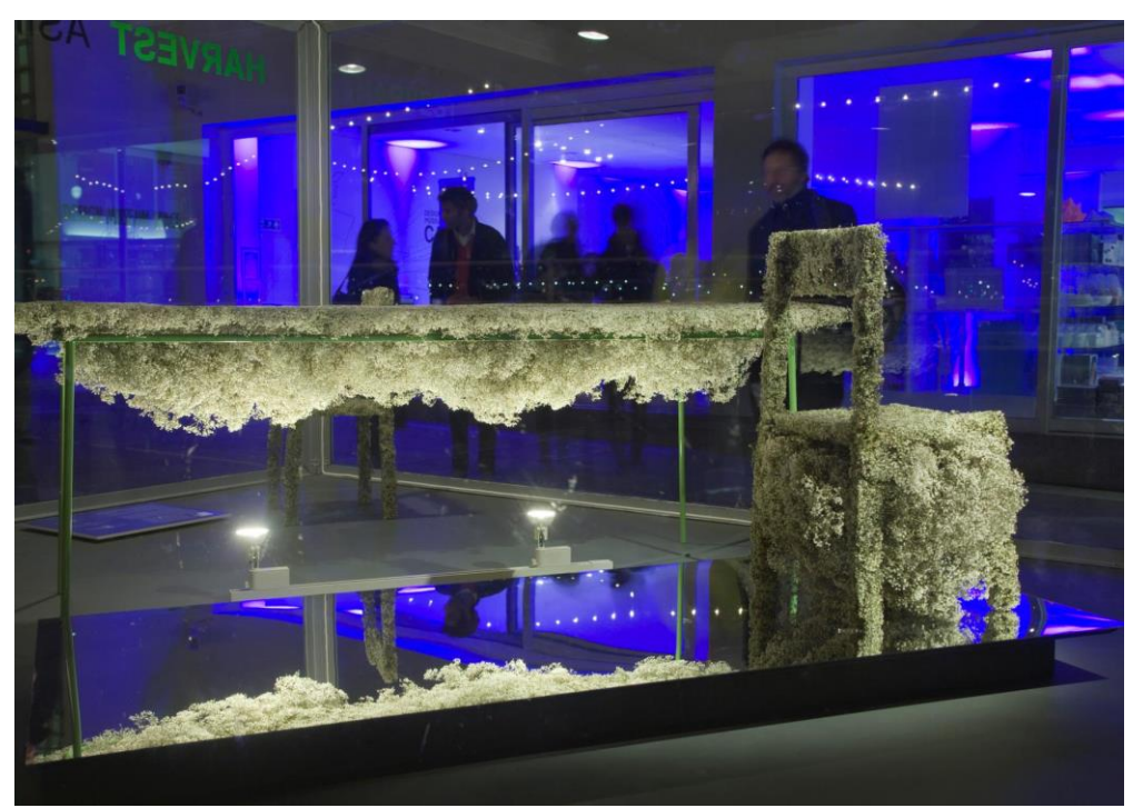
Harvest, Asif Khan, 2009.