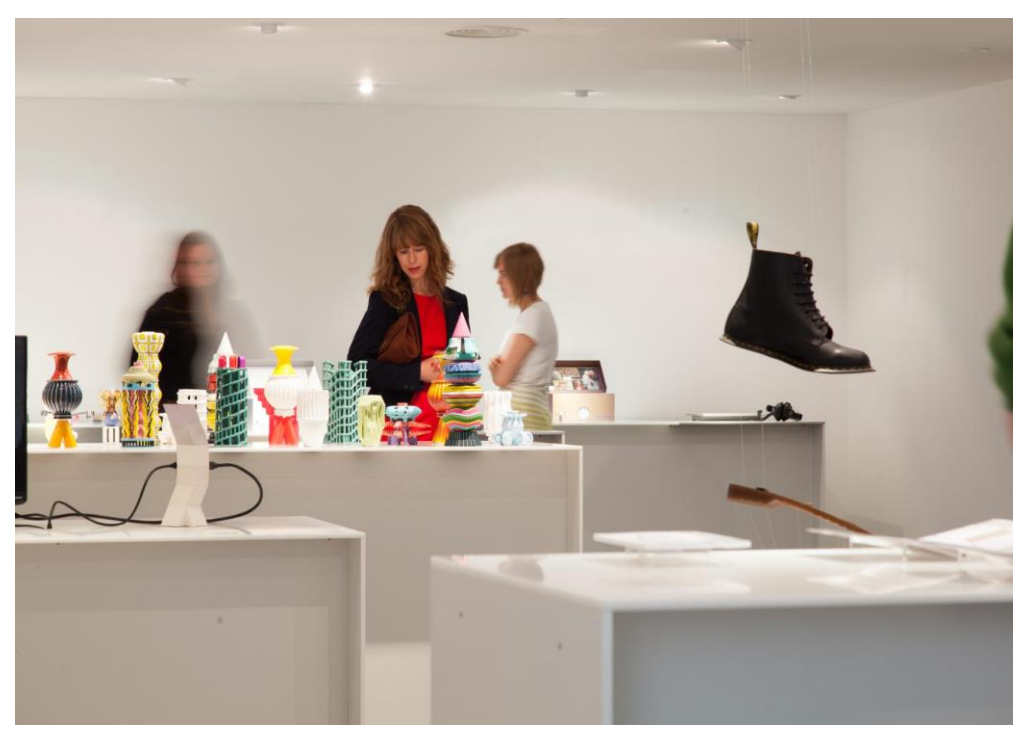
2013 - Designers In Residence exhibition – Identity