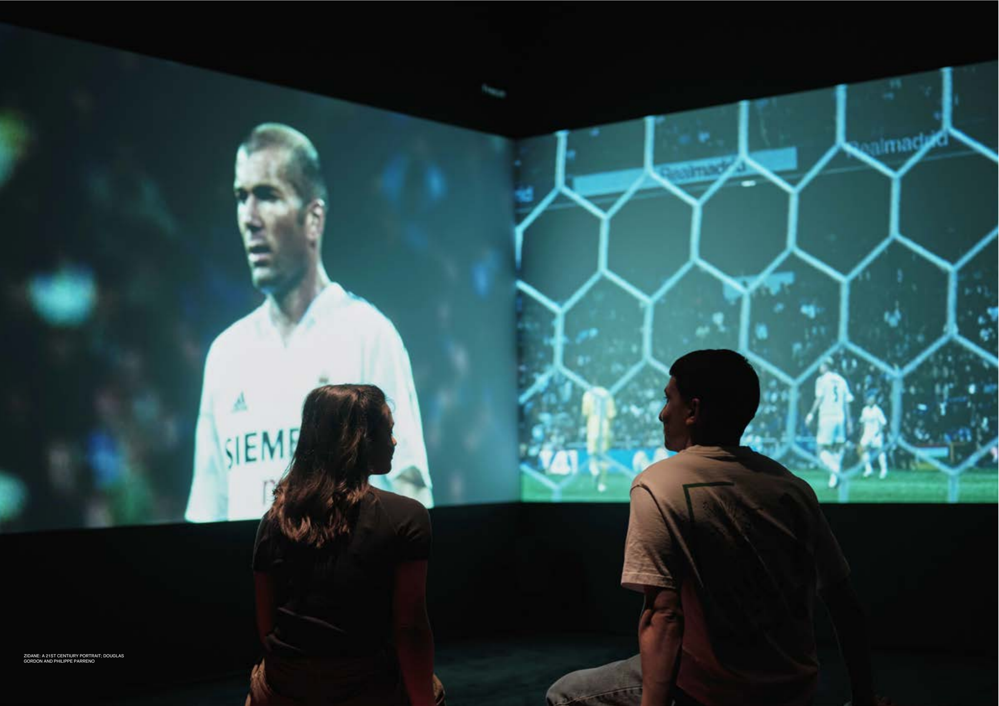
ZIDANE: A 21ST CENTURY PORTRAIT; DOUGLAS GORDON AND PHILIPPE PARRENO