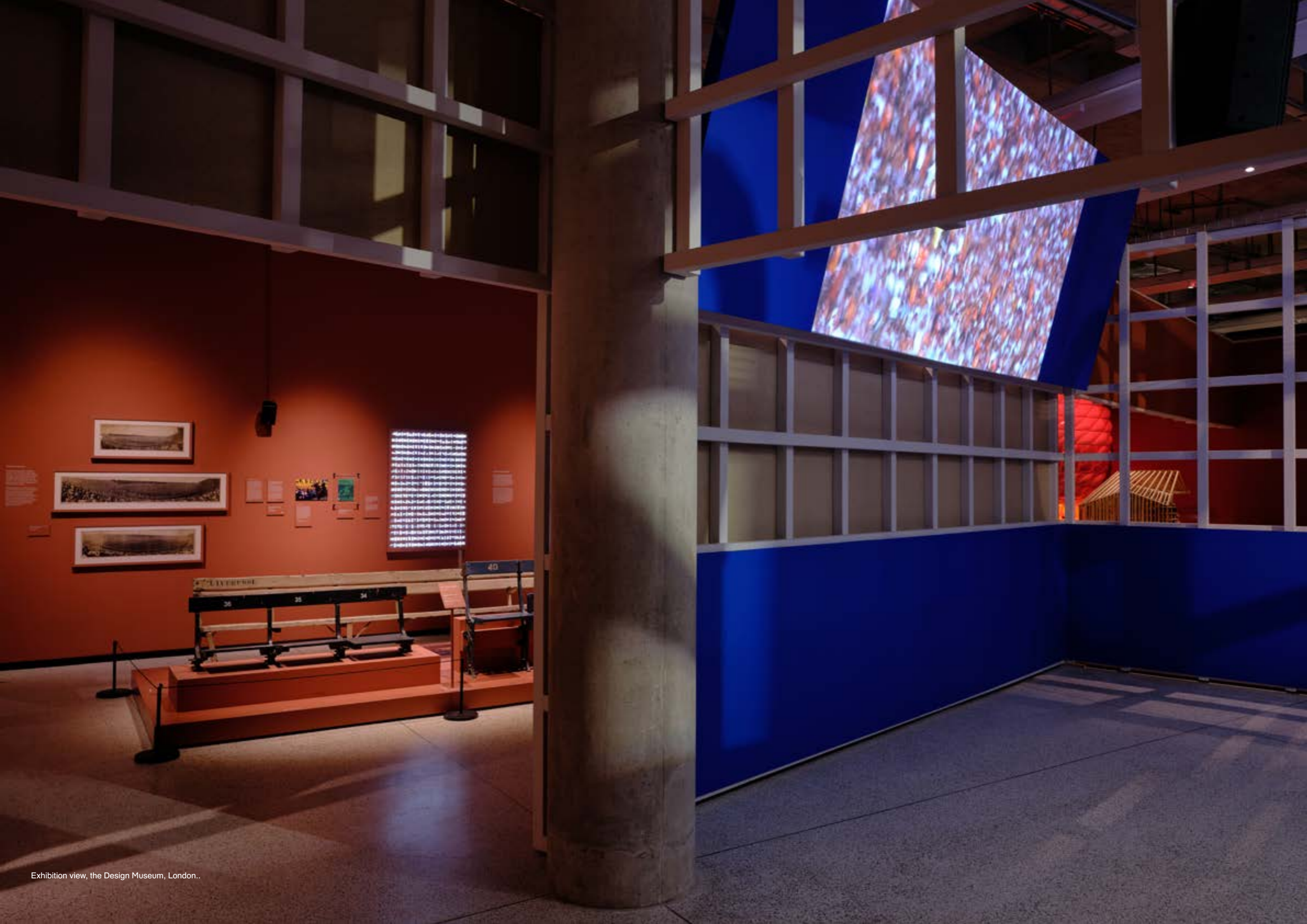
Exhibition view, the Design Museum, London..