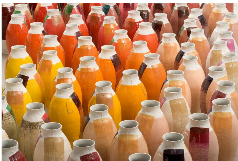
COLOURED VASES SERIES 3, ORANGES

Curator: Alex Newson Exhibition Design: Jongeriuslab Graphic Design: tbc Venues: Design Museum, London 28 Jun – 24 Sep 17 Availability: Autumn 2017 onwards Size: approx. 475 sq m