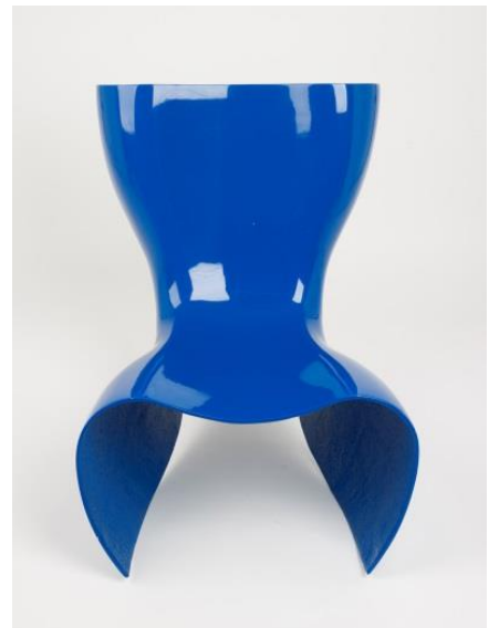
FELT CHAIR, MARC NEWSON, 1989