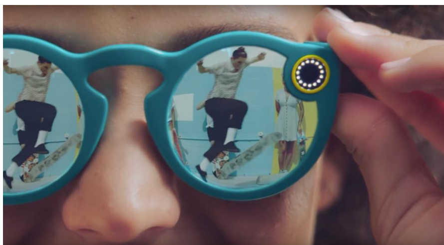
SNAPCHAT SPECTACLES, SNAP INC