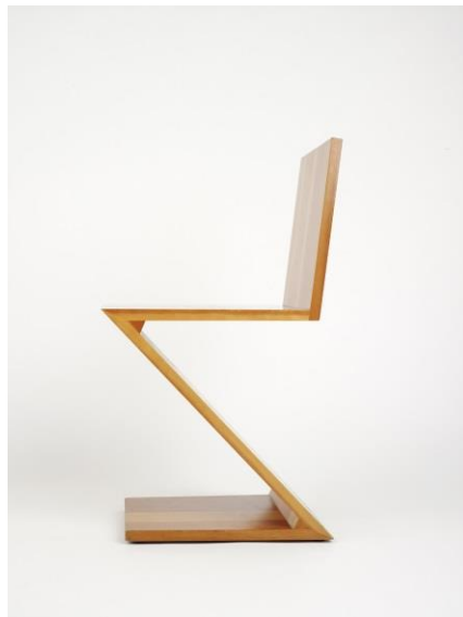
GERRIT THOMAS RIETVELD, ZIG-ZAG CHAIR, 1932-34