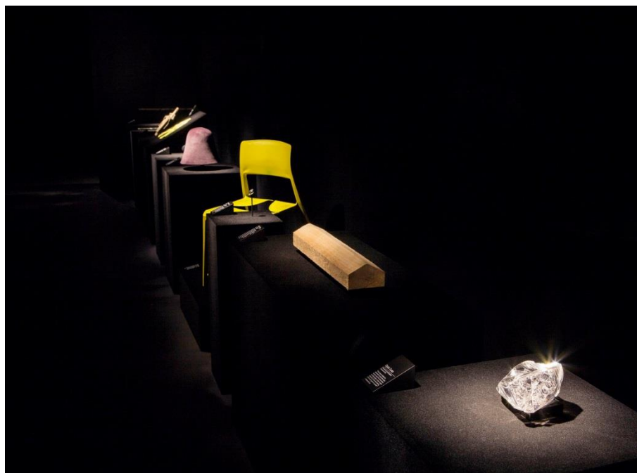
EXHIBITION VIEW. DESIGN MUSEUM, LONDON, 2014.