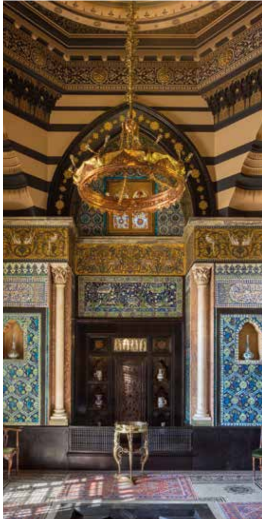
Image: The Arab Hall, Leighton House.