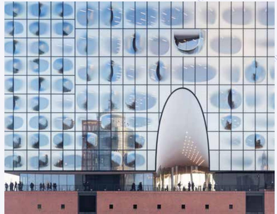
Image: Herzog & de Meuron Elbphilharmonie Hamburg, 2001-2016.