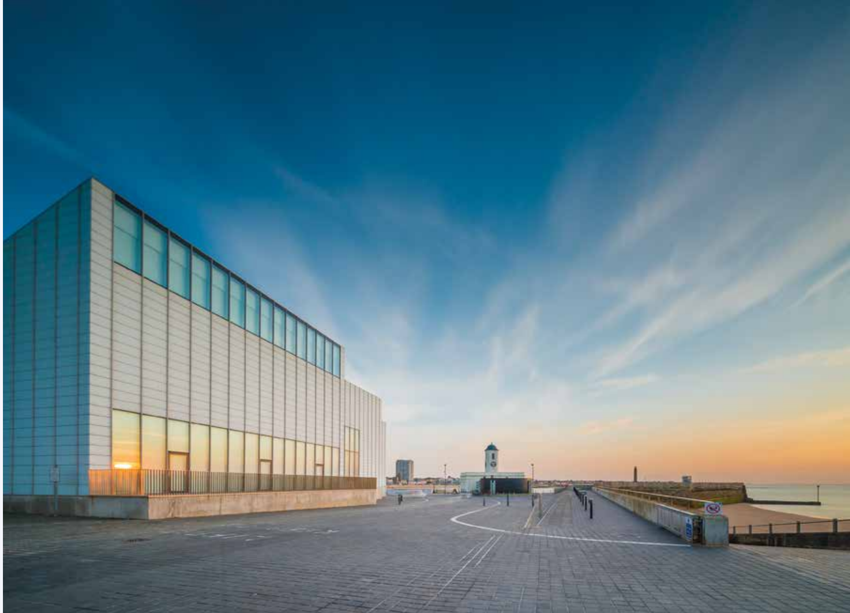
Image: Turner Contemporary, Margate. Image courtesy of Turner Contemporary. © John Sainsbury.

Exact details and times to follow but please register your interest with us.