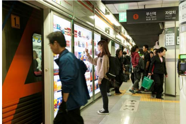
Homeplus Tesco Virtual Store, Seomyeon Subway Station, South Korea