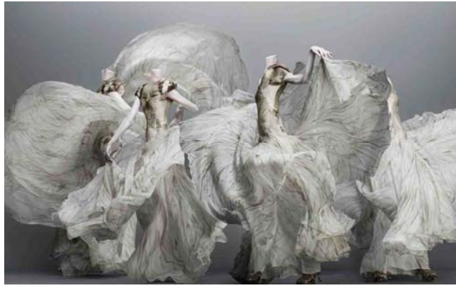
Alexander McQueen: Savage Beauty, The Costume Institute at the Metropolitan Museum, New York, USA