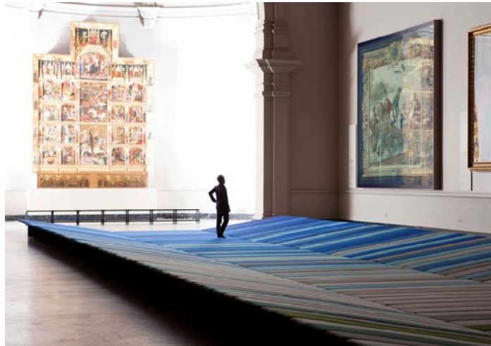
Textile Field at the Victoria and Albert Museum, London. Ronan and Erwan Bouroullec, in collaboration with Kvadrat