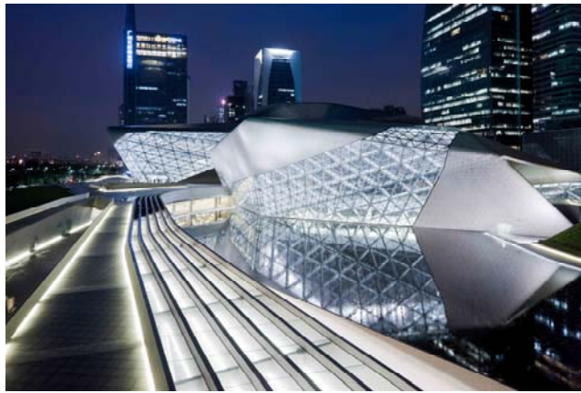
Guangzhou Opera House, China Zaha Hadid Architects