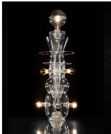
Totem no. 5 Ruy Teixeira, 2011 Bethan Laura Wood in collaboration with Pietro Viero