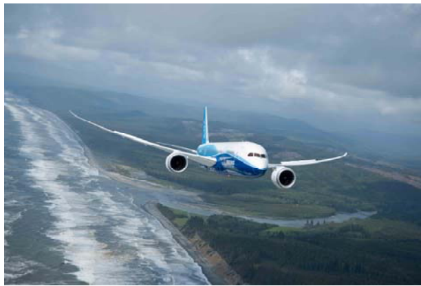
The Boeing 787 Dreamliner Ed Turner