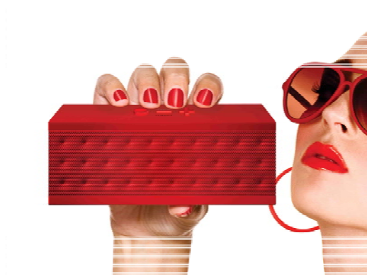
Jawbone JAMBOX Yves Béhar, Fuseproject