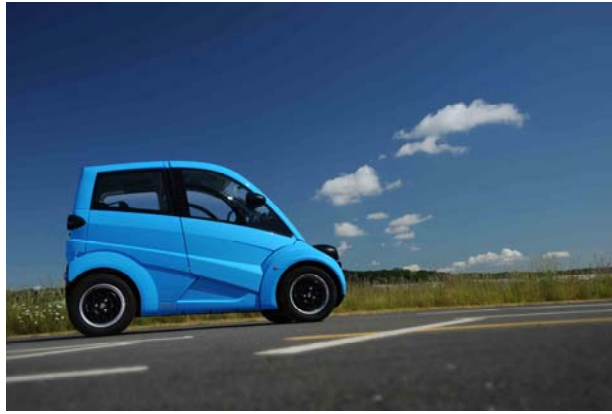
T.27 Electric Car Gordon Murray Design Limited