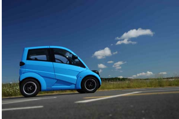
T.27 Electric Car Gordon Murray Design Limited