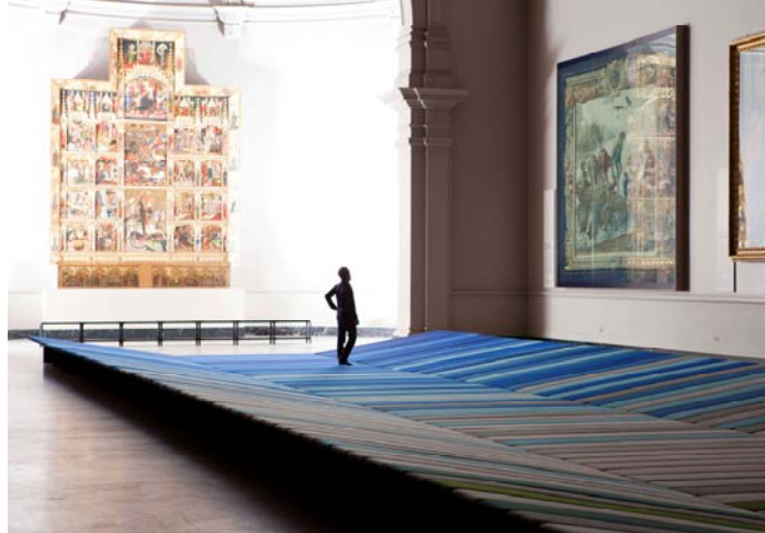
Textile Field at the Victoria and Albert Museum, London. Ronan and Erwan Bouroullec, in collaboration with Kvadrat