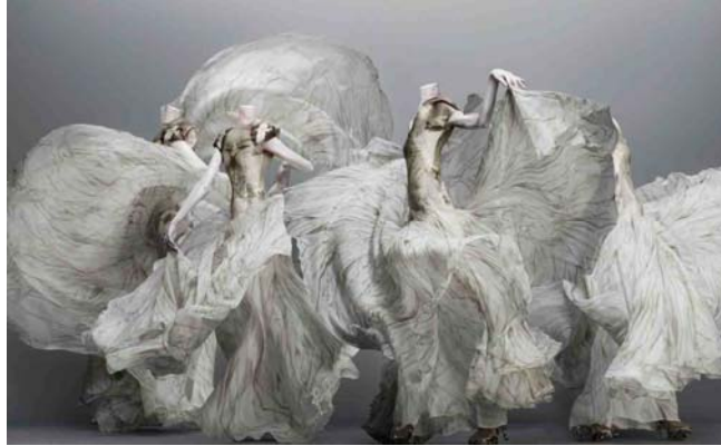
Alexander McQueen: Savage Beauty, The Costume Institute at the Metropolitan Museum, New York, USA