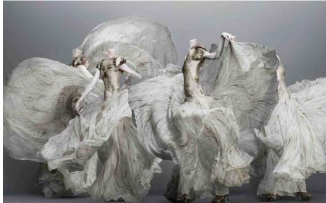
Alexander McQueen: Savage Beauty, The Costume Institute at the Metropolitan Museum, New York, USA