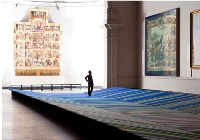
Textile Field at the Victoria and Albert Museum, London. Ronan and Erwan Bouroullec, fabric by Kvadrat