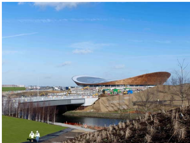
2012 Olympic Velodrome Hopkins Architects

Youth Factory, Mérida, Spain Selgascano, Gestaltskate and Jarex