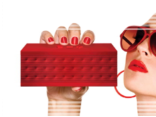
Jawbone JAMBOX Yves Béhar, Fuseproject