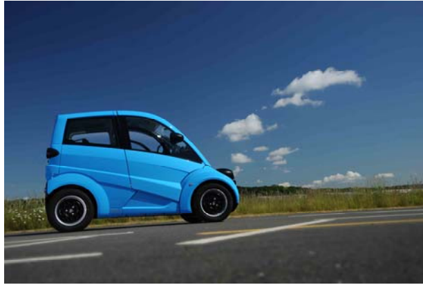
T.27 Electric Car Gordon Murray Design Limited