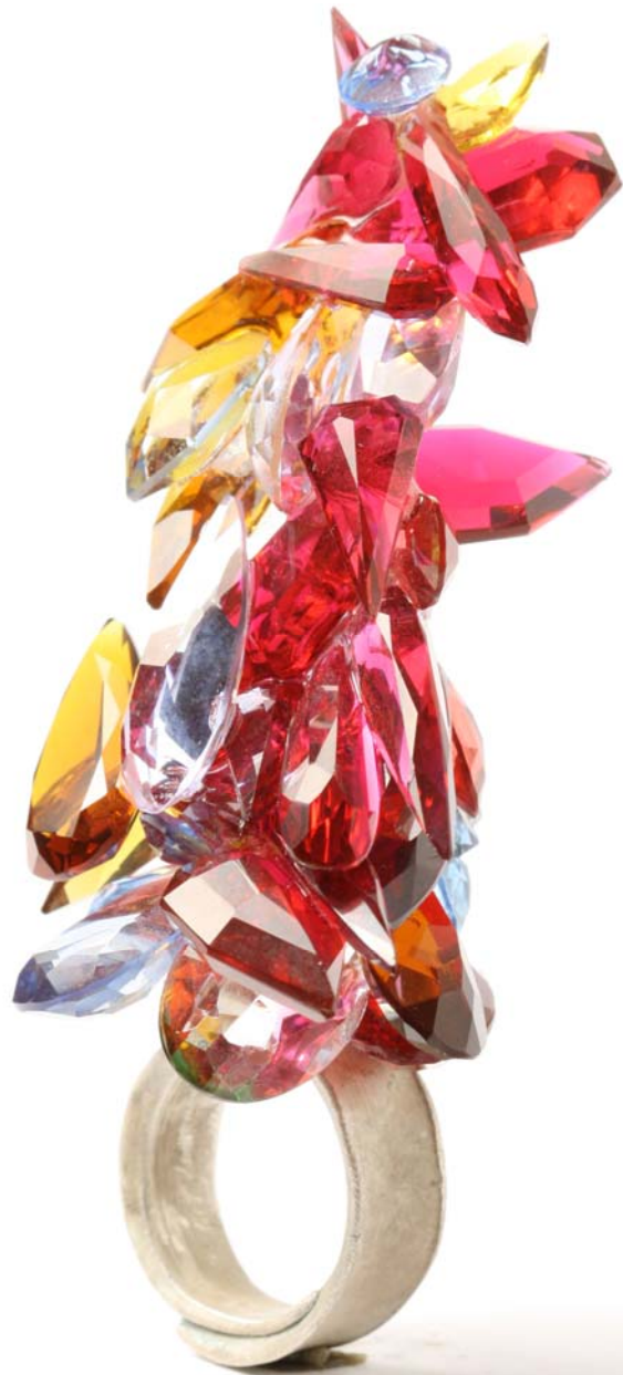
UNTITLED, KARL FRITSCH, 2008