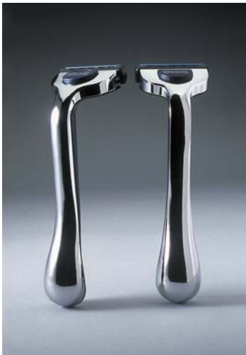
WILKINSON PROTECTOR, 1991