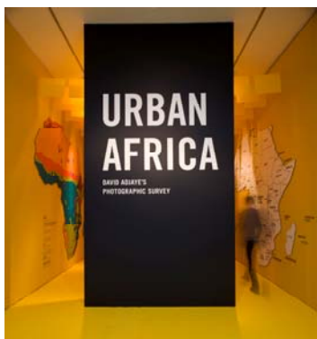
URBAN AFRICA, DESIGN MUSEUM, LONDON, 2009