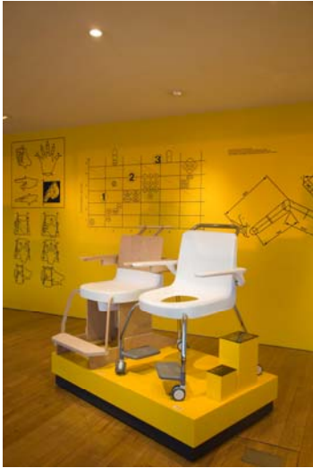
ERGONOMICS - REAL DESIGN, DESIGN MUSEUM, LONDON, 2010

From the humble tape measure and the household tap to the office chair and the vast and complex areas of transport systems and patient safety in health, Ergonomics is the study of how we interact with the products, services and the environment around us. Ergonomists gather scientific data which, when used by designers during the design process, can actively help us find our way more effectively; use a TV remote more effortlessly and administer medicine more safely. This engaging exhibition shines a critical and thought provoking light at the benefits of ergonomics in the design of so many products and systems that we depend upon and enjoy in our everyday lives.