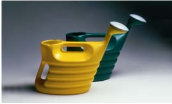
JETCAN GARDEN WATERING CANS, GECCO LCC, 1988