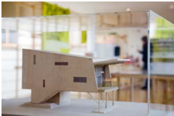
SUSTAINABLE FUTURES, DESIGN MUSEUM, LONDON, 2010

This exhibition presents key examples of how design can deliver a more sustainable future. It examines not only the objects themselves but also the infrastructure in which objects are produced and exist. At a time when designers and architects are under pressure to 'think green' and education establishments are placing greater emphasis on sustainability in the curriculum, this exhibition aims to highlight a selection of projects that either already exist or are in the making, that will set a precedent for how we can achieve a more sustainable future.