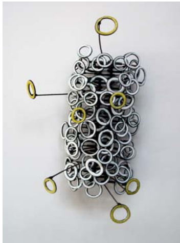
DUST SERIES BROOCH, SUSIE GANCH, 2010