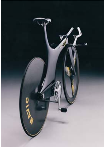
LOTUS SPORT PURSUIT BICYCLE, 1992

During a particularly important moment for UK sport, the increased profile for sport has led to a greater importance, and potential reward, for success. And in a profession where the difference between winning and losing can be as little as a fraction of a second, the importance of design to support, and to enhance performance is paramount. The exhibition will look at the various ways in which design has helped athletes achieve even greater accomplishments and pushed the boundaries of what was previously thought impossible. Taking in subjects as diverse as increased performance, improved safety and material innovations, Sport Vs Design will explore how, with continued research and analysis of function alongside the implementation of new materials and technologies, designers are able to create innovative sports equipment. This equipment not only helps to improve performance, but is often a fascinating and beautiful object in its own right. The exhibition will also look at moments where sporting innovations have been celebrated and expressed through visual culture by designers, photographers and artists.