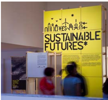
SUSTAINABLE FUTURES, DESIGN MUSEUM, LONDON, 2010