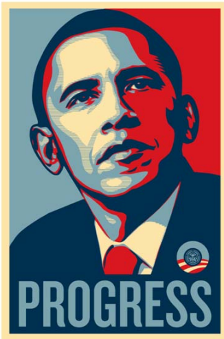
OBAMA, SHEPARD FAIREY, DESIGNS OF THE YEAR OVERALL AWARD WINNER 2009