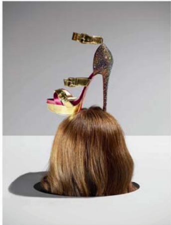
AMBER GOLD NAPPA FUSCHIA SATIN PLATFORM, FROM CHRISTIAN LOUBOUTIN, PUBLISHED BY RIZZOLI, 2011