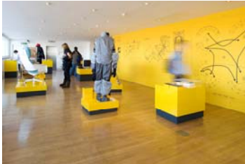
ERGONOMICS - REAL DESIGN, DESIGN MUSEUM, LONDON, 2010