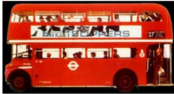
ADVERTISEMENT FOR PIRELLI SLIPPERS, ALAN FLETCHER, 1962

Exhibition and Graphic Design: Graphic Thought Facility