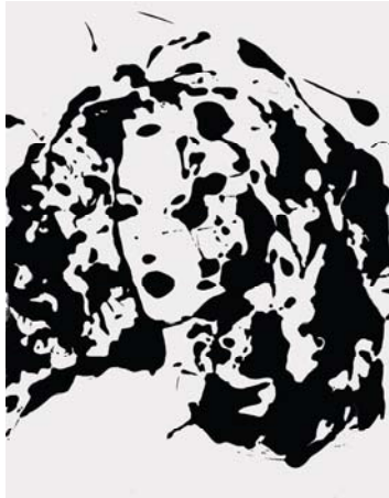
ALLURE BY FRANCOIS BERTHOUD FOR REBEL, FRANCE