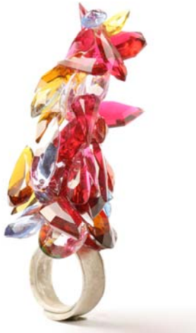
UNTITLED, KARL FRITSCH, 2008