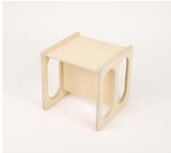
NICOLAI DE GIER, CHAIR TABLE UNIT, 1998