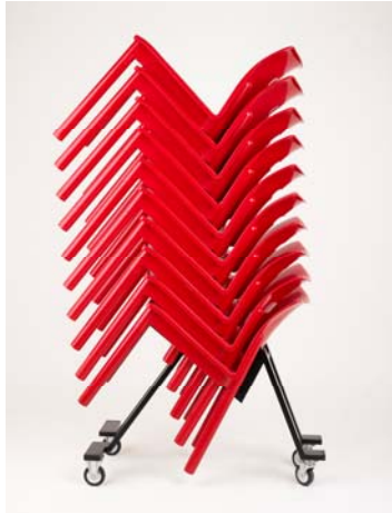
ANNA CASTELLI-FERRIERI, 4870 STACKING CHAIR, 1987-8