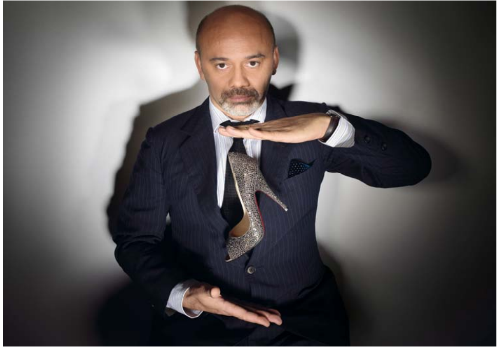
CHRISTIAN LOUBOUTIN