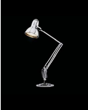
ANGLEPOISE LAMP, KENNETH GRANGE, 2002