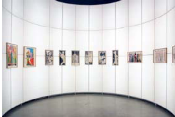
DRAWING FASHION, DESIGN MUSEUM, LONDON, 2010