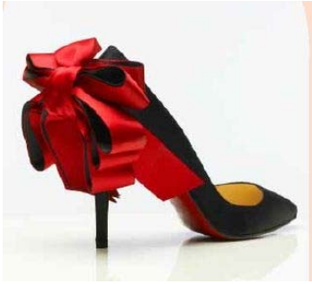
ANEMONE, CHRISTIAN LOUBOUTIN, 2007