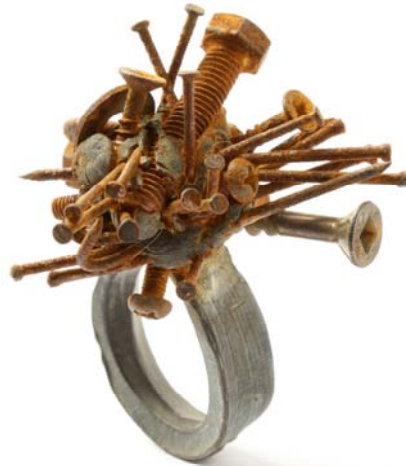
SCREW RING, KARL FRITSCH, 2005