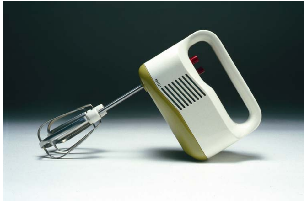
KENWOOD MINI-MIXER, KENNETH GRANGE, 1972