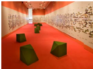
URBAN AFRICA, DESIGN MUSEUM, LONDON, 2009