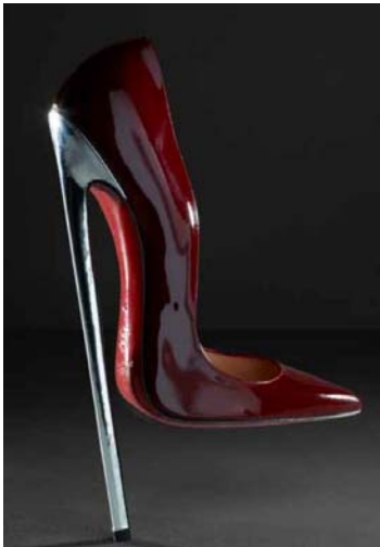
FETISH LA LYNCH, CHRISTIAN LOUBOUTIN AND DAVID LYNCH, 2007