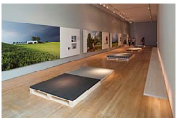
JOHN PAWSON – PLAIN SPACE, DESIGN MUSEUM, LONDON, 2010