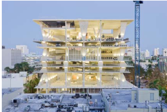
11 11 LINCOLN ROAD, MIAMI BEACH, USA ROBERT WENNETT // HERZOG & DE MEURON