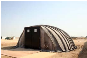
CONCRETE CANVAS SHELTER