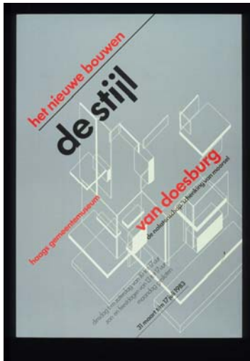
EXHIBITION POSTER. DE STIJL 1983

Six contemporary designers will take inspiration from Crouwel's career to produce a series of limited edition prints, a unique Wim Crouwel inspired wallpaper produced by Cole & Son will also be sold exclusively in the Design Museum Shop. Manufacture Des Tapis De Cogolin and partner company Tai Ping will produce a handmade rug reflecting Wim Crouwel's 'New Alphabet' design, this rug will be available to order from the Design Museum Shop.