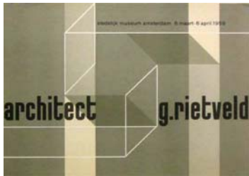
EXHIBITION POSTER, GERRIT RIETVELD, STEDLIJK MUSEUM, AMSTERDAM. MUSEUM BOYMANS BEUNINGEN 1959