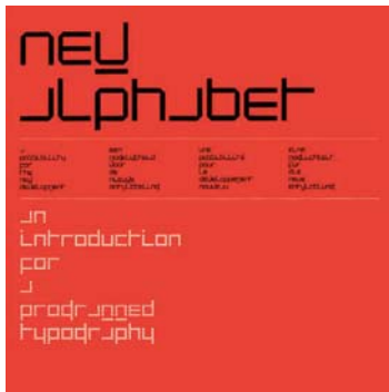
NEW ALPHABET 1967