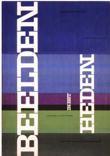
EXHIBITION POSTER 1959

Original sketches, posters, catalogues and archive photography will be on display alongside films and audio commentary. In addition to celebrating Crouwel's career this exhibition will also explore his legacy and influence on contemporary graphic design with commentary from leading industry figures including Peter Saville and Stefan Sagmeister .