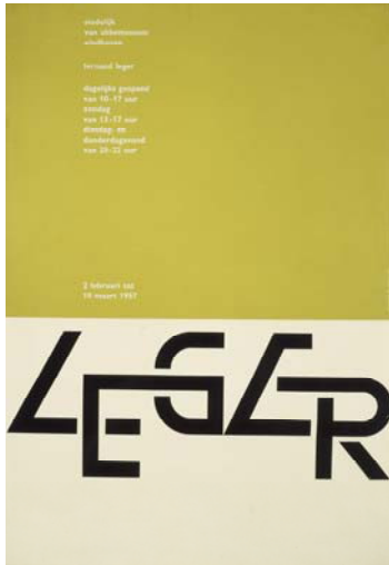
EXHIBITION POSTER, LEGER NEW ALPHABET VAN ABBE MUSEUM, QUADRAT-PRINT, DE JONG & CO 1957

In 1963 Crouwel founded the multi-disciplinary design agency 'Total Design' creating the identity for numerous Dutch companies. Together with the founding partners, Crouwel shaped the visual landscape of the Netherlands throughout the 60's and 70's, working for clients such as IBM, and typeface commissions for Olivetti. In the 1970s Crouwel was part of a team of four designers who designed the Dutch Pavilion for the Osaka World Fair, Crouwel also designed numerous postal stamps for the Dutch post office and a controversial redesign of the telephone book using only lowercase letters.