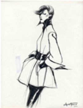
ANTONIO, KARL LAGERFELD, VOGUE FRANCE, 1972