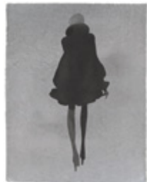
MATS GUSTAFSON, ALEXANDER MCQUEEN FOR VOGUE CHINE, 2010, WATERCOLOUR

Drawing Fashion celebrates a unique collection of some of the most remarkable fashion illustrations from the 20 th and 21 st Centuries. These original illustrations reflect not only the spirit and style of the decades, but also evoke a sense of elegance and glamour long associated with the world of couture and high fashion. Drawings from the collections of Chanel, Dior, Comme des Garçons, Poiret, Lacroix, McQueen and Viktor & Rolf amongst others, will feature in the exhibition, which charts the changing perception of fashion drawings from its origins as an advertising tool used prior to the advancements of photography, through to its establishment as a unique representation of collections which has endured through to today's leading designers.