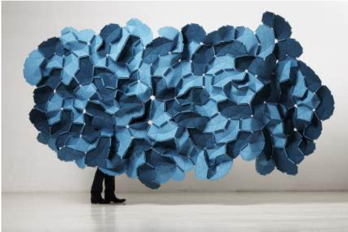
Clouds, Denmark Ronan and Erwan Bouroullec for Kvadrat