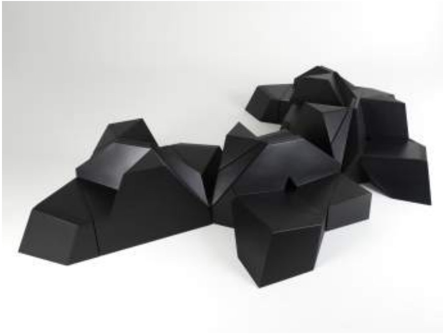
Polytopia, Australia Lucas Chirnside