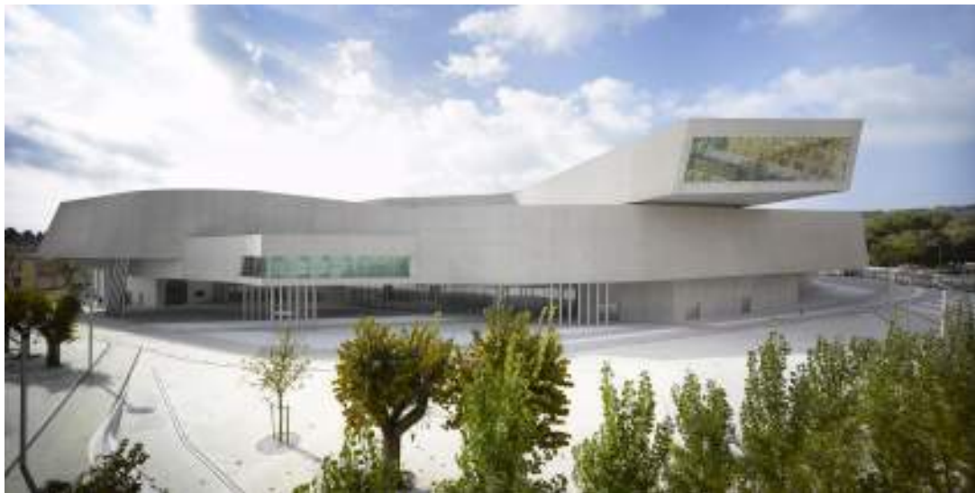
MAXXI, National Museum of the XXI Century Arts, Rome, Italy Zaha Hadid Architects