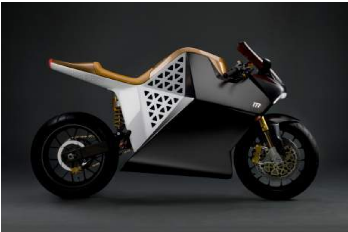
Mission One Superbike, USA Yves Béhar for Mission Motors