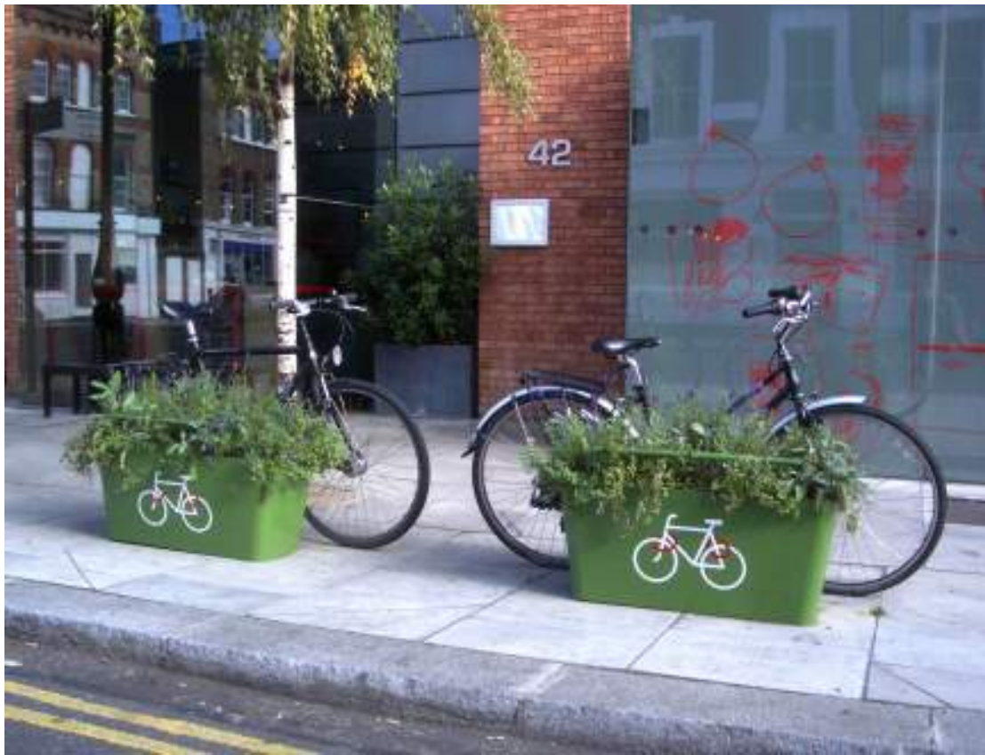
PlantLock, UK Front Yard Company