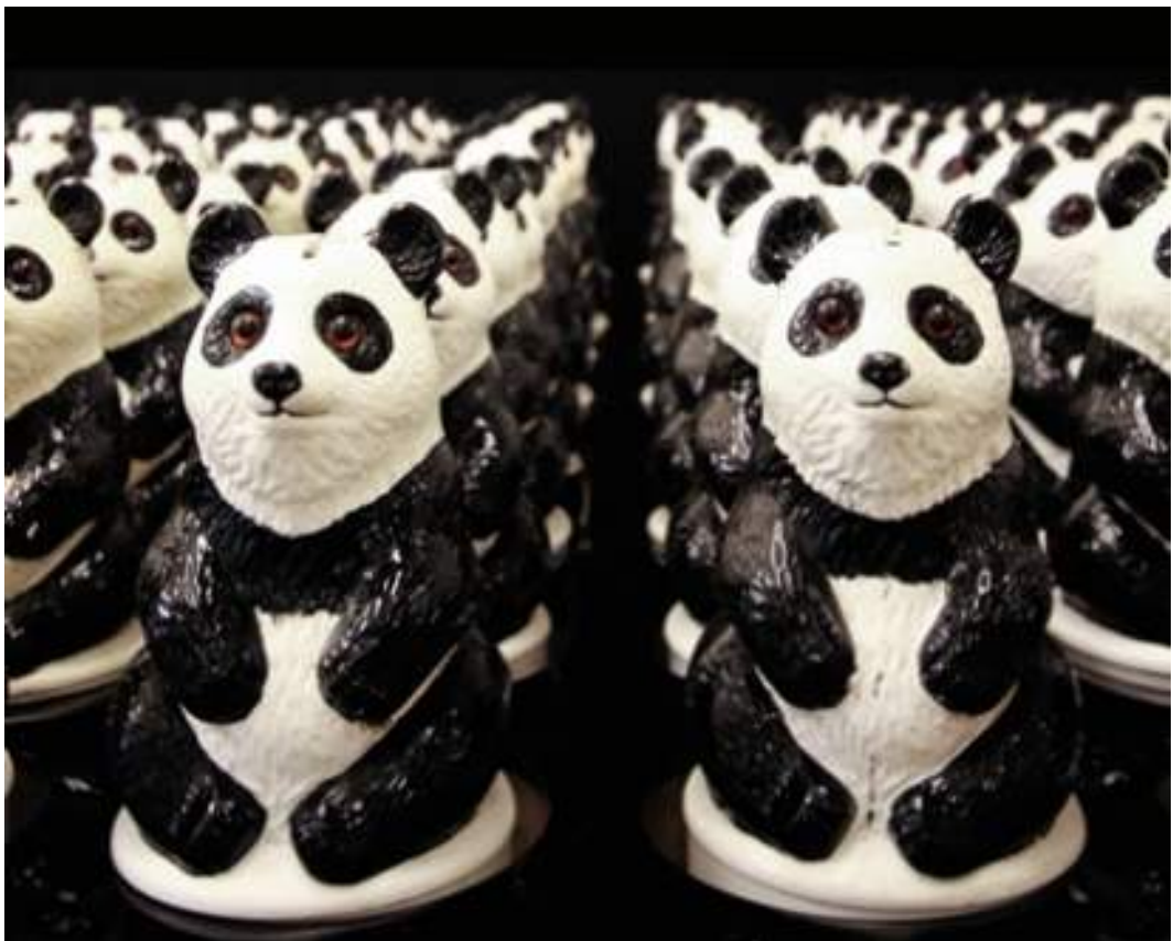
Panda Eyes, UK Jason Bruges Studio for WWF