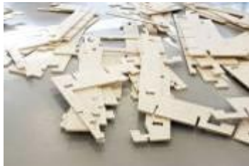
WIKIHOUSE, PIECES, 2012.