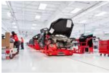
TESLA MOTORS, 2013.