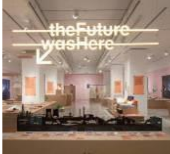
THE FUTURE IS HERE, DESIGN MUSEUM, 2013.