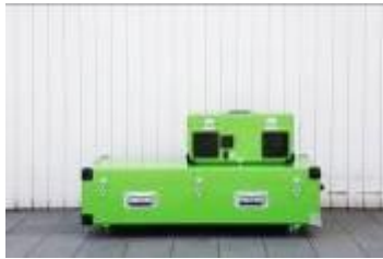
MICHAEL WARREN DESIGN, GROW PORTABLE CNC MACHINE, 2012.