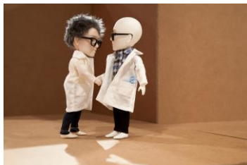
MAKIE LAB, MAKIE DOLLS, 2013.