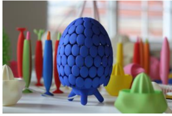
ASSA ASHUACH, SMALL OBJECTS COLLECTION.