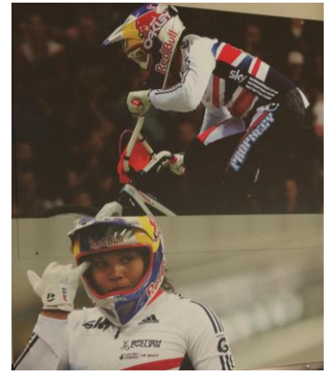
Three times BMX World Champion Shangze Reade

Designed by Italian bicycle manufacturer Pinarello, who made the Espada (the Blade) frame used by Miguel Indurain for his 1994 hour record. The key differences to the bike are the removal of the brakes and gear levels and a new one-piece handlebar system designed to optimise Wiggins' interaction with the bike. Also featured is the aerodynamic carbon fibre helmet used to give Wiggins the edge when fighting wind resistance.