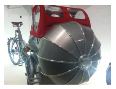
Boxer Rocket uses a side car style retro future look to great effect