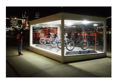
Tank Installation – Santander Hire Bikes