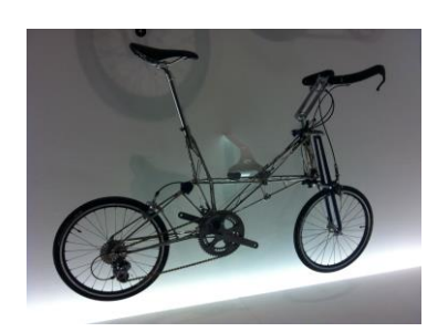
Double Pylon Moulton Bicycle