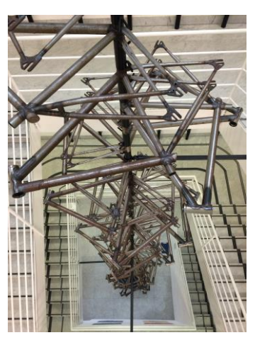
Ben Wilson's cycle frame sculpture