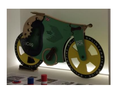
SplinterBike made from wood and glue.