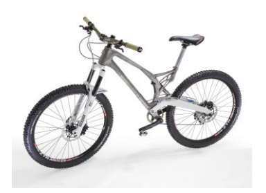
The Future - 3D printed bicycle by Renishaw and Empire Cycles