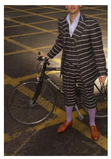
Dashing Tweeds reflective fashion wear