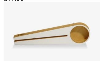
For Coffee Lovers Hile Coffee Scoop £19.95