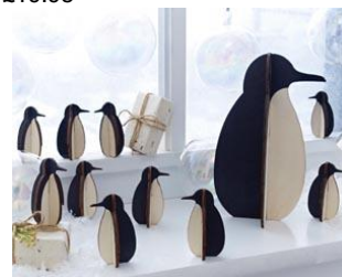
For Christmas Penguins from £4.95