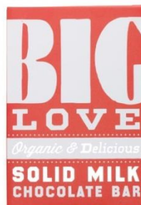
For Chocolate Lovers Big Love Chocolate Bar £10