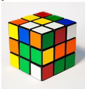
For Retro Design Classic Rubik's Cube £15.00