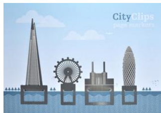
For Architects City Clip Page Markers £6.75