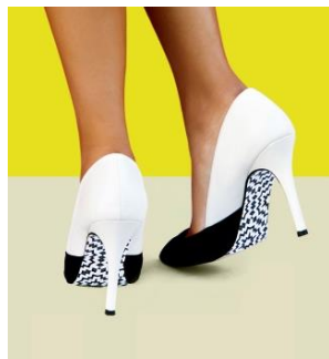
For Fashion Lovers Shoelicks – stickers for your soles £3.99