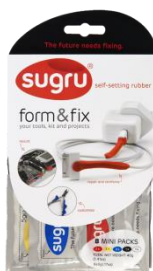
For the Product Designer Sugru Form and Fix pack £12.99