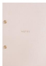
For Glamorous Note-takers Studio Sarah notebook £14.95 each