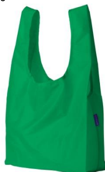
For Sustainability Enthusiasts Baggu Folding Bag £7.50