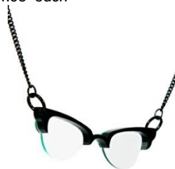
For Jewellery Lovers Tatty Devine From £10