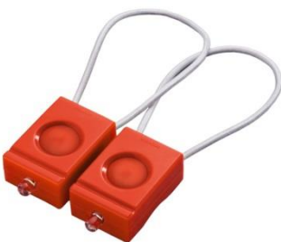
For The Cyclist Bookman lights £19.99- £35