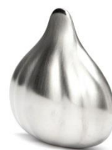
For Foodies Savon de Chef from Alessi £17.50