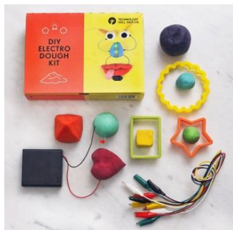
For Kids That Love Doing Technology Will Save Us kits from £13.50