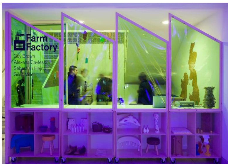
Farm Factory, Farm, 2010