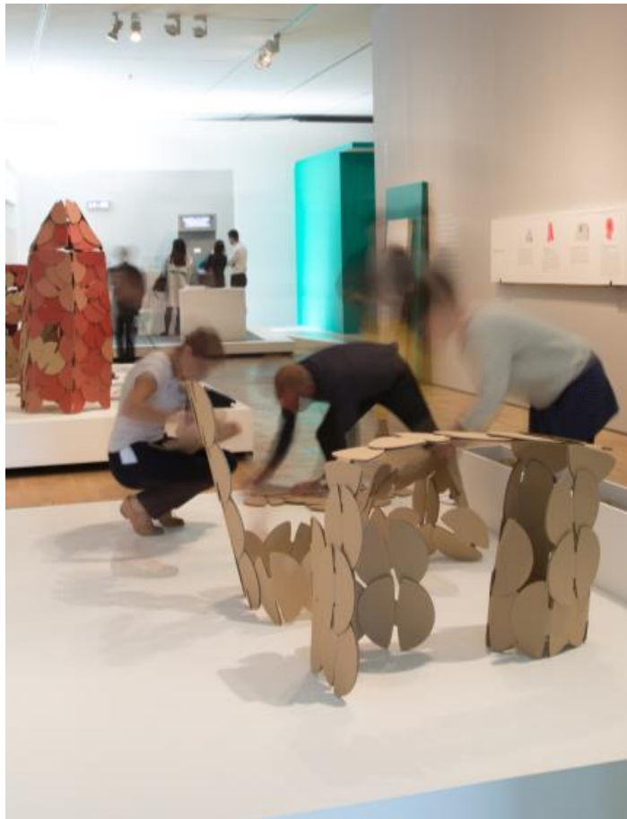
Nook, Torsten Sherwood, Disruption, 2014