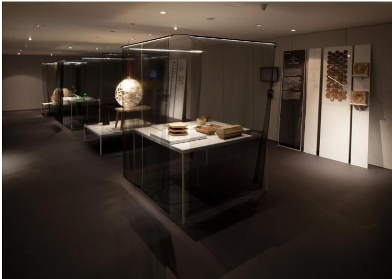
2012 Designers in Residence exhibition – Thrift