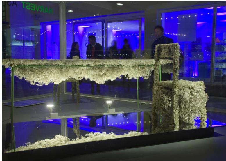
Harvest, Asif Khan, 2009