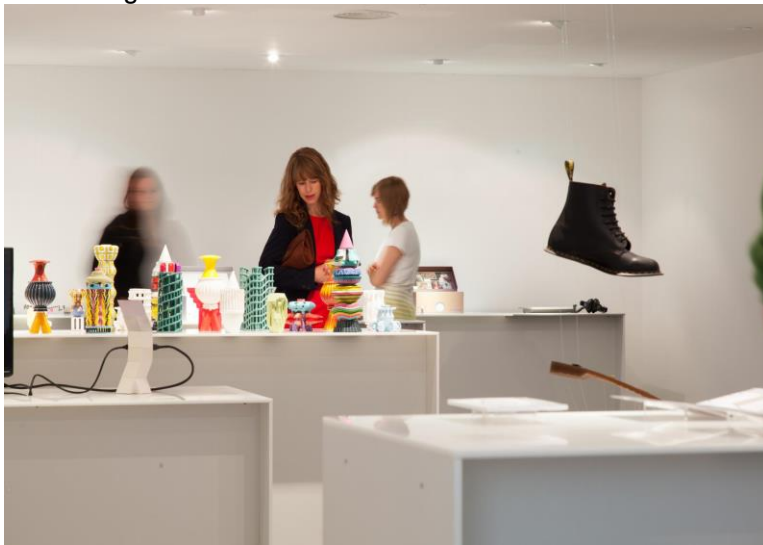
2013 Designers in Residence exhibition – Identity