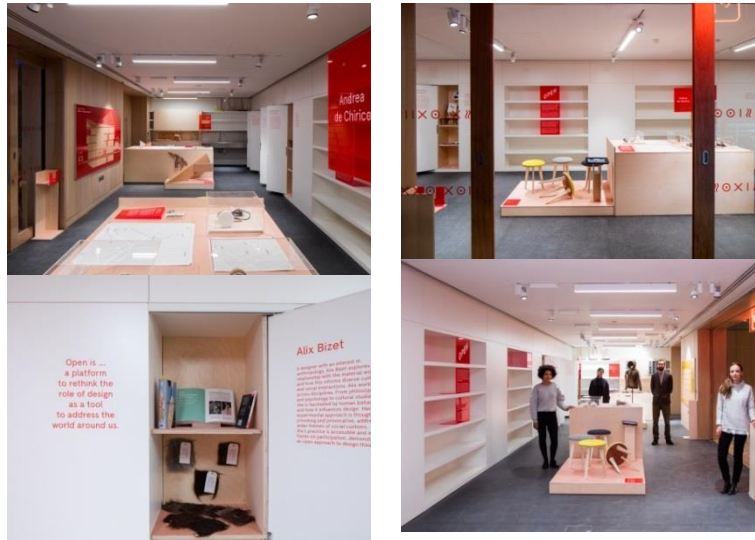
Designers in Residence studio, and showcase 2016.