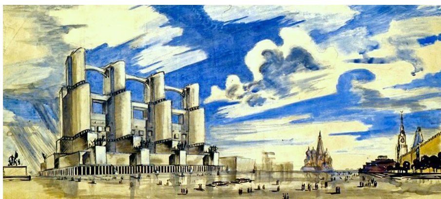
VESNIN BROTHERS' NARKOMTIAZHPROM PROPOSAL FOR MOSCOW, 1934

Curator: Eszter Steierhoffer Venues: Design Museum, London 16 Mar – 4 Jun 17 Availability: Summer 2017 onwards Size: approx. 475 sq m