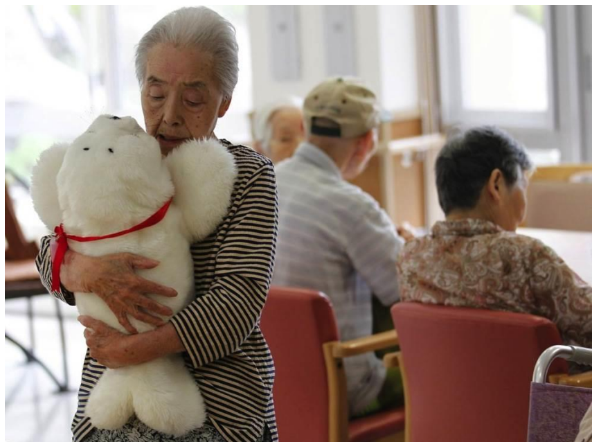
PARO THE SEAL, FOR COMMUNITY CARE OF PEOPLE WITH DEMENTIA