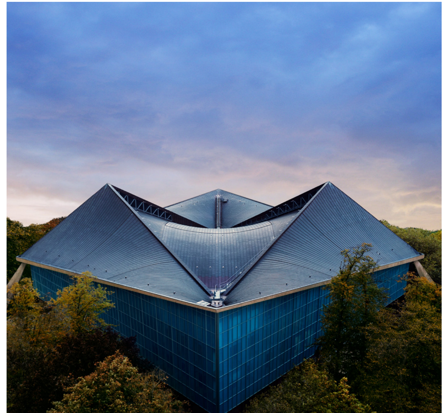
the Design Museum, London