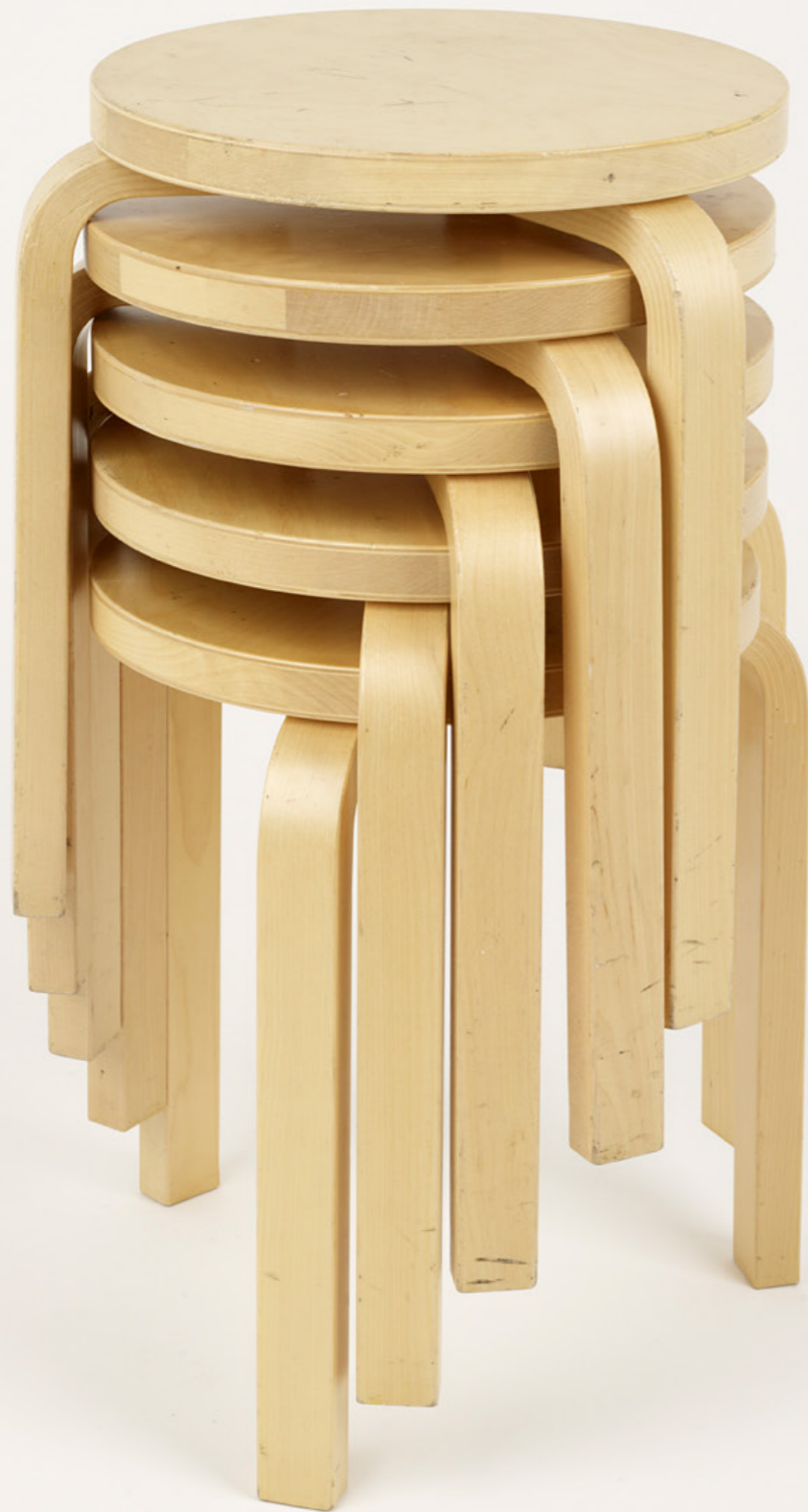
Stool 60, Alvar Aalto